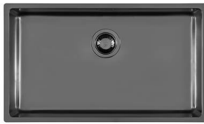
Sink KE Gun Metal 2157 856